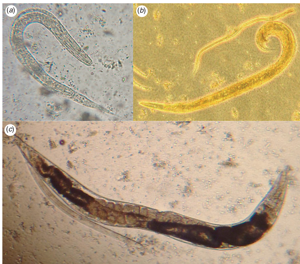
Figure 1. Life stages of Strongyloides stercoralis in agar plate culture: (a) rhabditiform larva; (b) a free-living adult male with filariform larva adjacent; and (c) a gravid, free-living adult female with filariform larva adjacent.

Several tests for the serological diagnosis of strongyloidiasis have been described, using both crude and recombinant antigens. Two commercial ELISA kits employing somatic antigens are available from BORDIER ( Strongyloides ratti antigen) and IVD Research ( S. stercoralis antigen), respectively 14 . Recently, two recombinant antigens (32 kD recombinant antigen, called NIE and S. stercoralis immunoreactive antigen, SsIR) have been employed for serological testing in both ELISA and luciferase immunoprecipitation system assay (LIPS) platforms 15 . The reported sensitivity and specificity of various serological platforms ranges from 56-100% and 29-100%, dependent upon the method, antigens, cut-offs, study populations, and reference methods employed 16 . Strongyloides serology using a crude larval extract antigen was shown in one study to be less sensitive for the diagnosis of returned travellers (73%) compared to patients who have lived for an extended period in an endemic area (98%) 17 . No definitive study of serological methods has been conducted to date, and much of the available data is subject to flaws in methodology, particularly the use of microscopy only as a reference