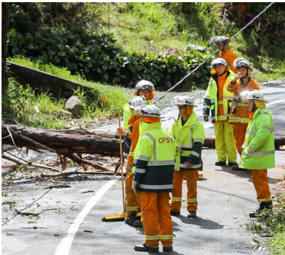
▲ Above: ALL EXPERIENCES PROVIDE OPPORTUNITIES FOR LEARNING TO OCCUR.

asking: how is the experiential learning cycle being managed? How are the processes of reflection, sense-making, and experimentation being fostered, to support new ways of working?