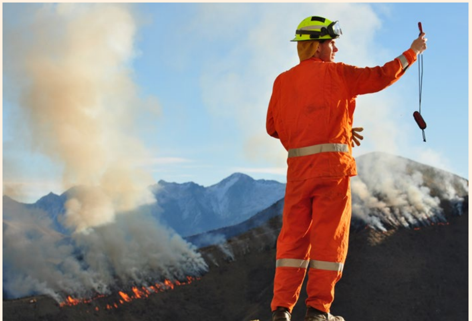
▲ Above: THIS STUDY IS INVESTIGATING HOW ORGANISATIONS CAN IMPROVE THEIR CAPACITY TO LEARN THROUGH EXPERIENCE.

Broad challenges have been identified that agencies need to manage in order to enhance and sustain learning. These include shifting value from action post an