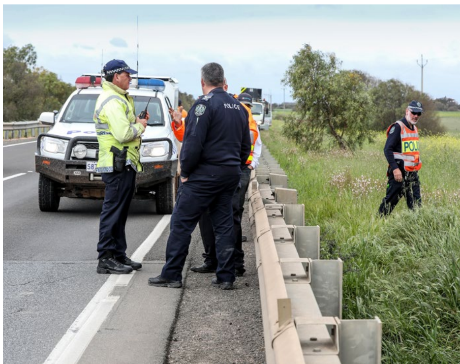
▲ Above: EXPERIENCES SUCH AS OPERATIONS, AFTER-ACTION REVIEWS, RESEARCH PROJECTS OR OTHER TYPES OF INQUIRIES CAN ALL SUPPORT LEARNING.