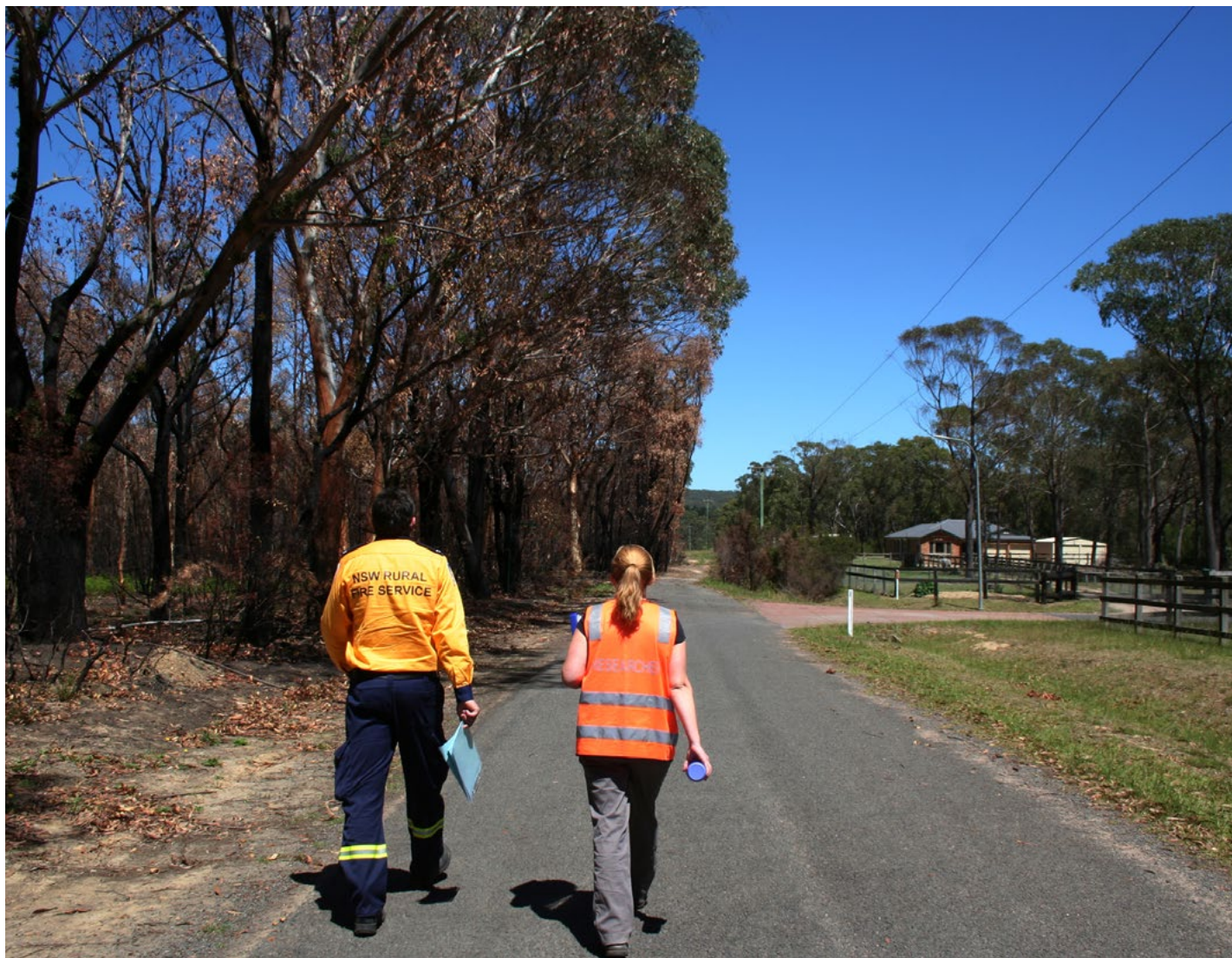
▲ Above: THIS RESEARCH WILL HELP EMERGENCY MANAGEMENT STAFF AND VOLUNTEERS FUNCTION MORE EFFECTIVELY IN INCREASINGLY COMPLEX ENVIRONMENTS.