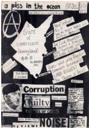
Issue One of Cameron's fanzine