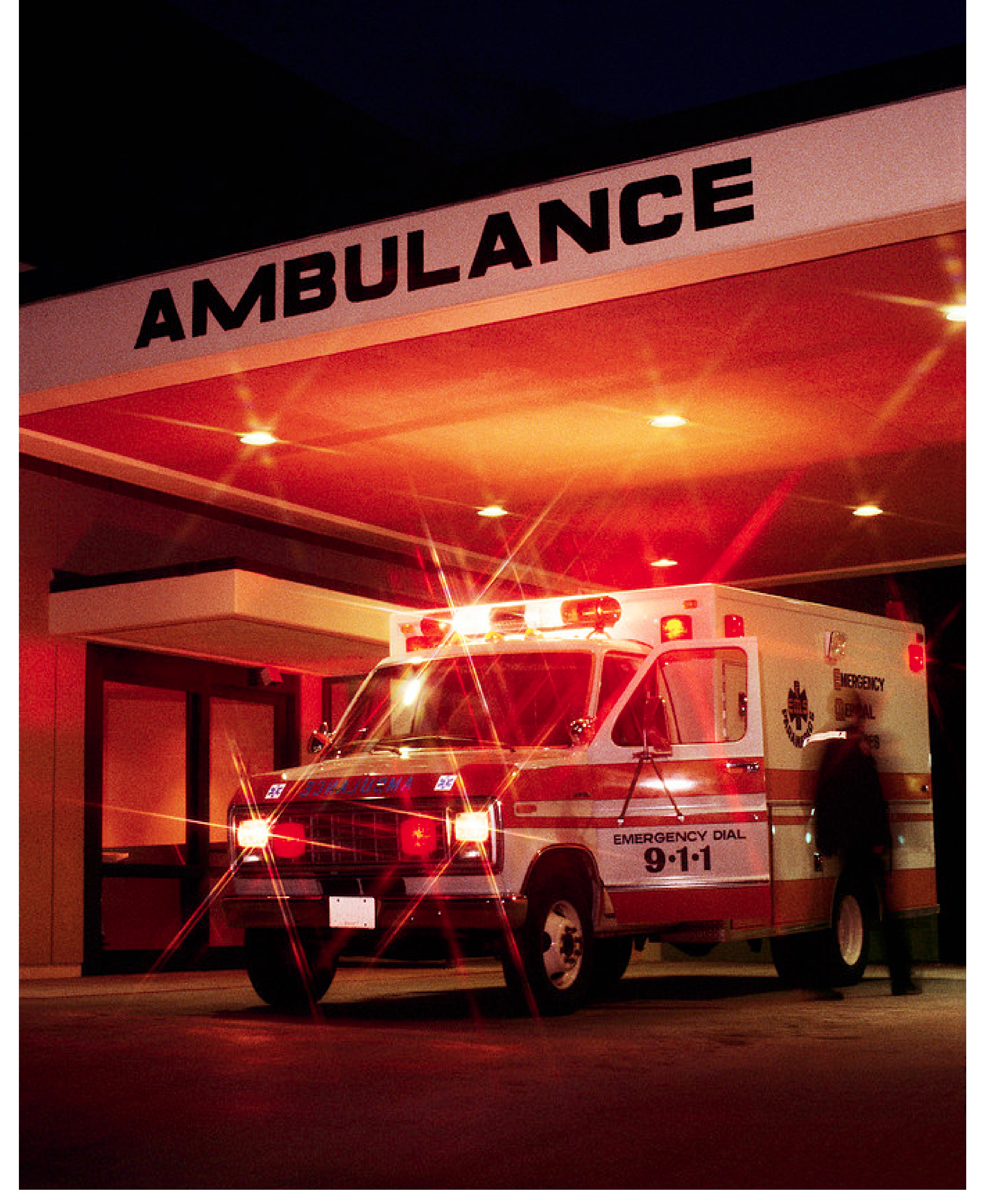
service to clients presenting with a mental illness.

The aim of this study was to better understand the interdisciplinary relationships between mental health nurses and ED triage nurses that are necessary to sustain an emergency mental health triage