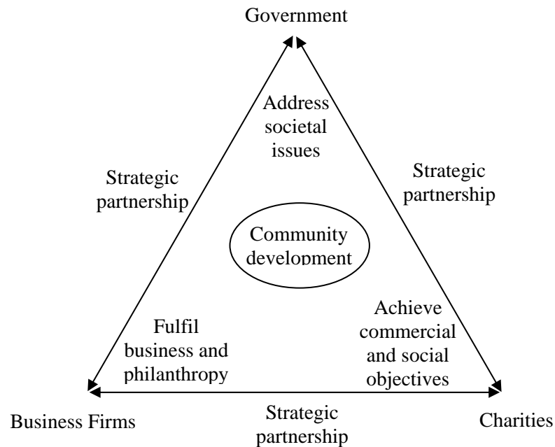
FIGURE 1. Business-Charity-Government Strategic Partnership

In the business-charity-government strategic partnership, business firms act as major funding providers. Through the strategic partnership, business firms gain a reputation which focuses not only on profit, but also social issues that concern community. An improved reputation likely increases sales and revenues. In other words, a strategic partnership between business-charity-government assists business firms to fulfil both business and philanthropic objectives.