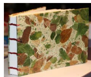
AKM18 Forest Floor, AK Milroy, 2012 (19cm x 13cm x 3cm))