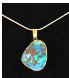
AKM5 Memories of an Inland Sea Series, AK Milroy, 2012 (4cm x 3cm)