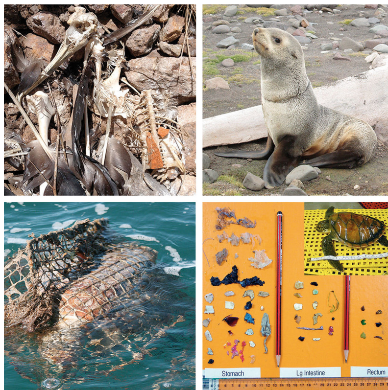
Fig. 3. Top left to bottom right — magnificent frigatebird Fregata magnificens carcass from Battowia Island, Grenadines, with orange foam contained within stomach; Antarctic fur seal Arctocephalus gazella , with plastic ring entanglement at King George Island, Antarctica; juvenile green turtle Chelonia mydas trapped in discarded crab trap and plastic fragments recovered from the gut of a juvenile green turtle

When taken in conjunction, it is clear that plastic pollution is impacting food webs through ingestion