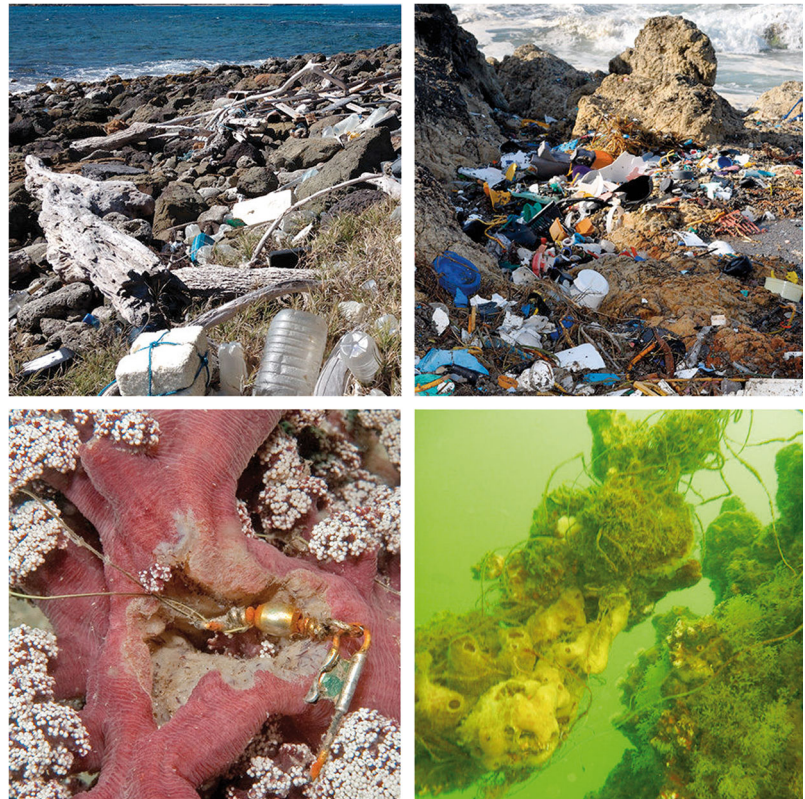
Fig. 2. Clockwise from top left—beach debris from a remote beach on Catholic Island, Grenadines (courtesy Jennifer Lavers); debris accumulation on an urban beach (Stradbroke Island, Australia) (courtesy Kathy Townsend); entanglement and damage to soft coral by fishing line (courtesy Stephen Smith); and fishing line entanglement of a pier with algae and sponges growing on it (courtesy Kathy Townsend)

Quantifying the impact of plastic pollution on the physical condition of habitats has received little attention (but see Votier et al. 2011, Bond & Lavers 2013, Lavers et al. 2013, 2014) relative to the impacts of plastic pollution on organisms (e.g. Derraik 2002, Gregory 2009). However, in intertidal habitats, accumulation of plastic debris has been shown to alter key physico-chemical processes such as light and oxygen availability (Goldberg 1997), as well as temperature and water movement (Carson et al. 2011). This leads to alterations in macro- and meiobenthic communities (Unepetty & Evans 1997) and the inter-