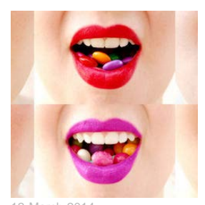
12 March 2014 Totally addicted to apps: difficulty makes Candy Crush so sweet