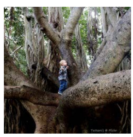
19 March 2014 Hug a tree – the evidence shows it really will make you feel better