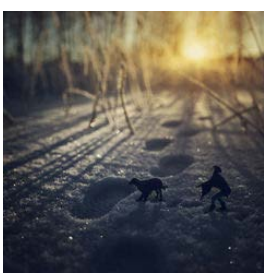
19 March 2014 Nothing wrong with a digital detox but wired nature is better

Young men are much more likely to engage in risky gambling than either women or older males. A recent small study of gambling among Sydney-area adolescents, for example, showed 6.7% (or 17 students) had gambling problems, and all were boys. This gender difference may be attributable to the