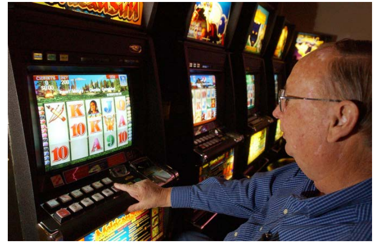
Sadly, there's no magic button to stop excessive gambling.

Lecturer, Health Social Work Griffith University