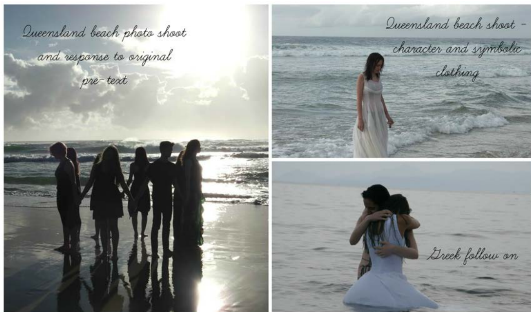
Figure 5 Example of 'rolling' within the content created