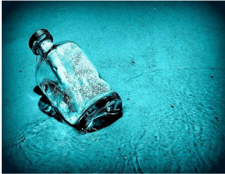
Figure 2 Building the fictional frame - image created of the message in the bottle