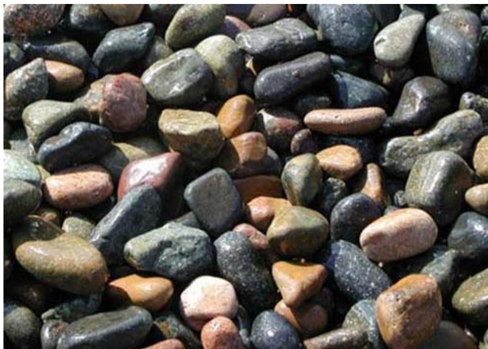
Unsorted stones on Turners Beach

Being barely drilled and unskilled in the natural sciences my classification is most abstract. Indeed, beyond the “base” prototype of rock and the “subordinate” granite , I cannot be more concrete (Rosch 27-48). My learned options for textual description run out.