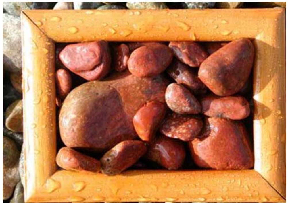
When photographing the granites I made use of a picture frame to cluster them into a composition with relatively straight edges that could then be cropped without slicing through whole stone shapes