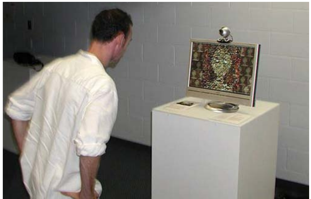
Hands-free interaction at the "Making Badlands" conference exhibition