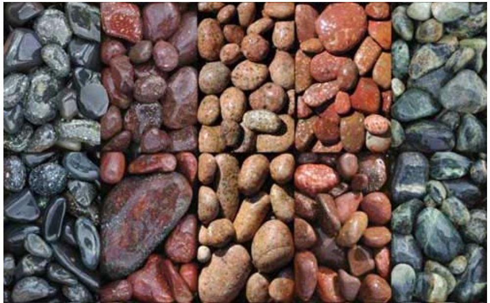
Photos of the palette of five primary hue categories established according to a visual grammar highlight variance as much as consistency

Bear in mind that in the case of my preoccupation I was aware of no specific cultural precedent and that I had at that time no clearly defined intent other than the visual investigation in its own right. I was not looking for gold or other mineral commodity, though it had crossed my mind that one could produce attractive kitchen bench top laminate in the form of terrazzo either from the stones themselves or from images of them.