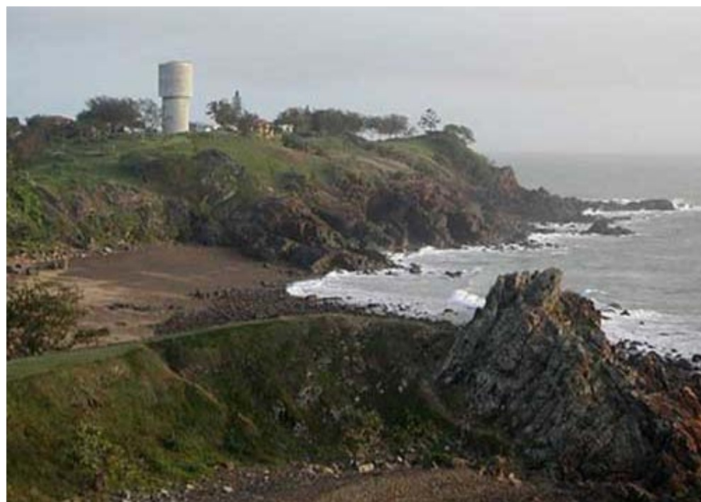
Turners Beach at Slade Point in the mid-ground with the hidden coves beyond

To the south of those isolated coves beyond a particularly rugged and impassable headland lies a broader, longer stretch of beach with coarse golden coloured sand which terminates abruptly in a rocky bed running parallel to the shore in line with the low tide mark. At its southern end is another headland with an organ pipe rock feature beyond which sweeps Lamberts Beach and a stretch of sand that continues to the Mackay Harbour some ten kilometers away. This is Turners Beach.