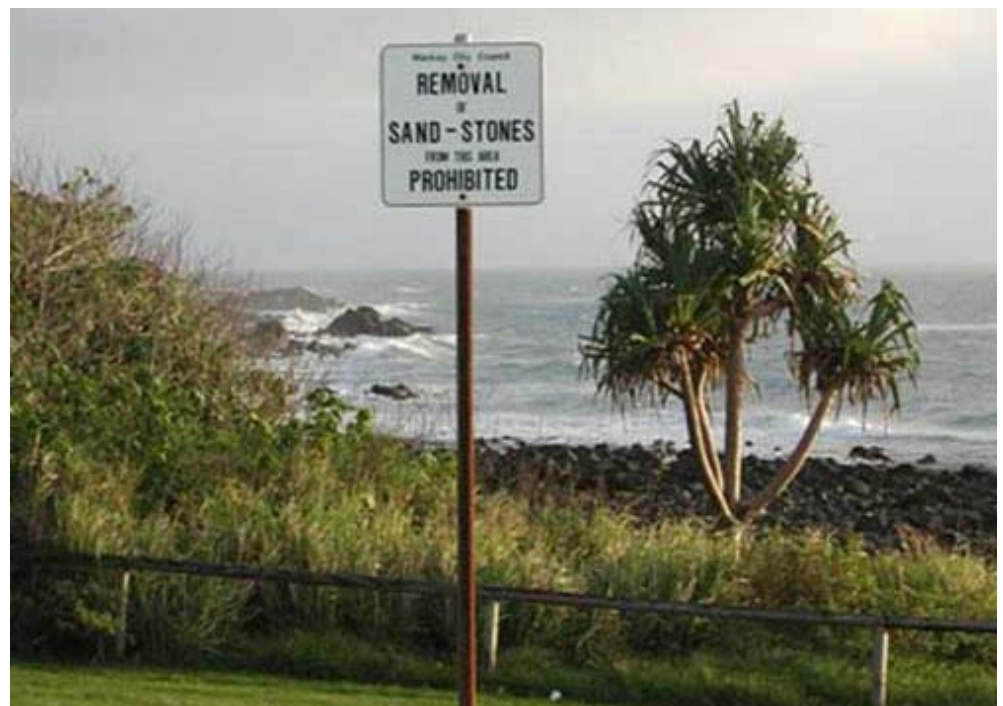
Sign adjacent to Turners Beach

Over time, as Karpathakis suggests is possible, the significance of my rock collecting practice changed and so too my intent in regard to the ritual and the artifacts themselves. There were no more corners in the garden that needed softening. In addition my conscience was provoked after considering a sign adjacent to Turners Beach which reads: Mackay City Council REMOVAL OF SAND – STONES FROM THIS AREA PROHIBITED . Figuring that I had progressed from a casual souvenir gatherer to a habitual removalist I decided on socio-ethico grounds that my practice should cease.