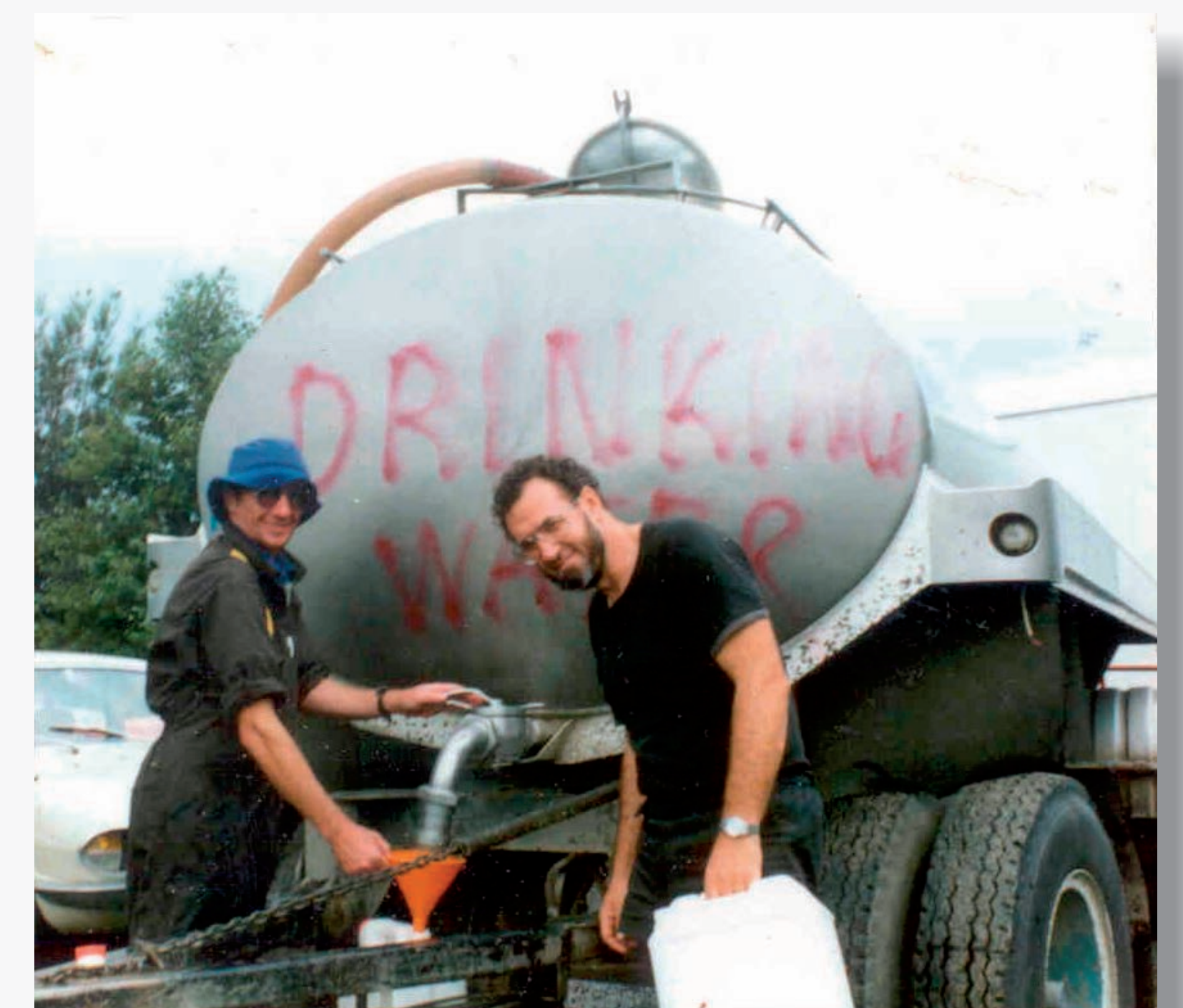
Figure 4. Residents collecting water after the Edgecumbe earthquake. Having pre-prepared stocks of water could reduce demand and assist with resilience after an event.

Approximately 20 unstructured interviews will be undertaken with individuals in each community to explore how people make meaning of hazard information, and the factors behind why these people do, or do not, prepare. Communities will also be monitored over time to explore the effects of any subsequent education programmes and engagement strategies.