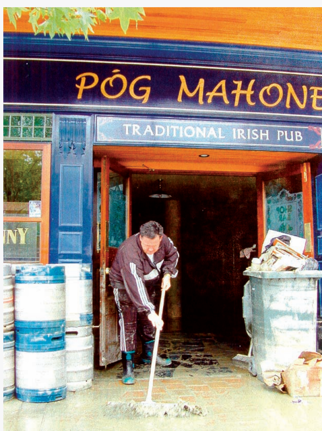
Figure 2. Community clean-up and recovery after the 1999 Queenstown floods, New Zealand.

To date, as part of the modelling process, research has focussed on identifying predictors and defining the linkages between them to construct a model. However, there has been very little in depth study on the processes that influence specifically how individual, community and societal factors interact to determine how people render hazard information meaningful, and how this interactive process translates into preparedness actions. Research over the following three years will investigate this issue.