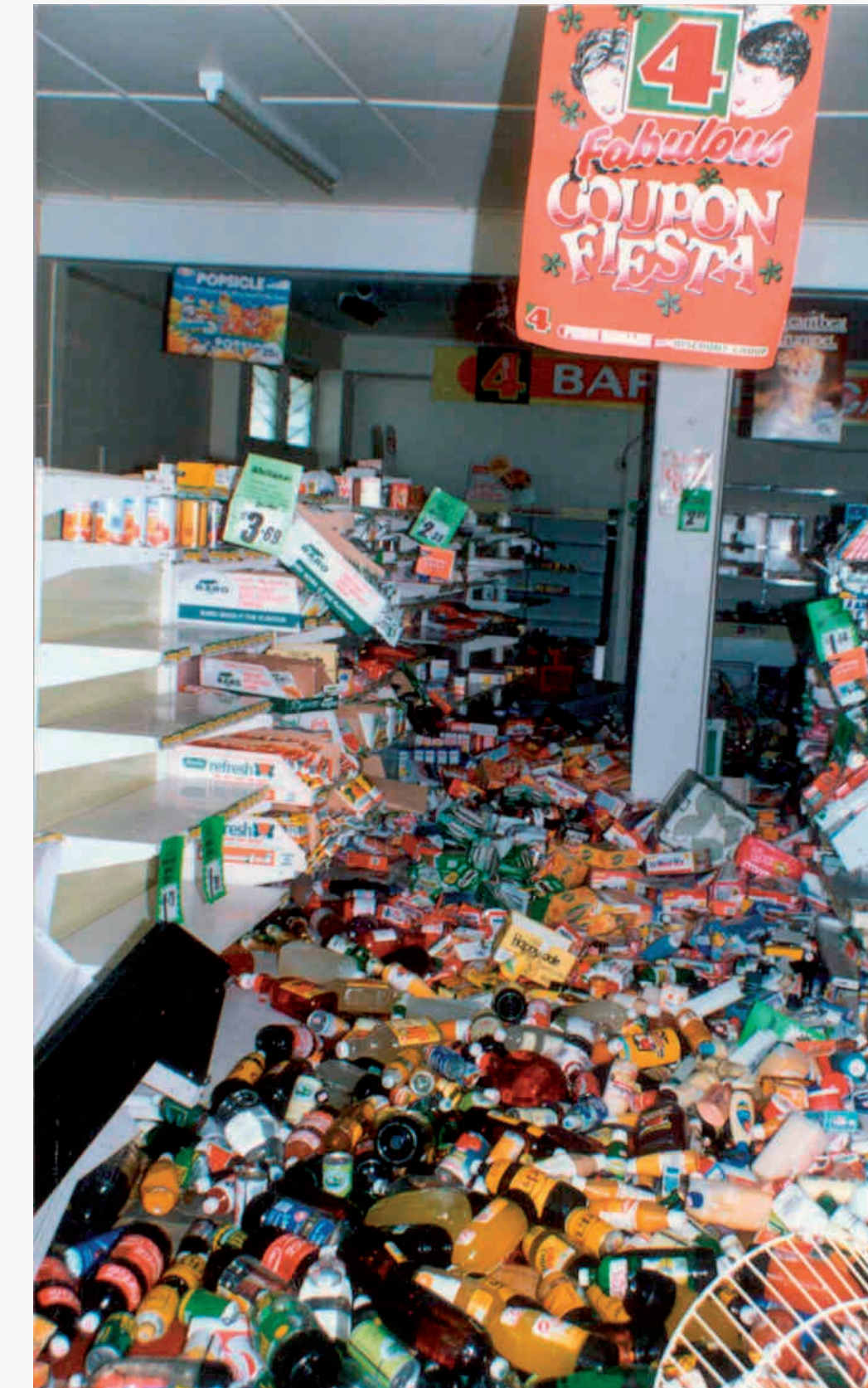
Figure 3. Items tossed from shelves during the 1987 Edgecumbe earthquake, New Zealand.