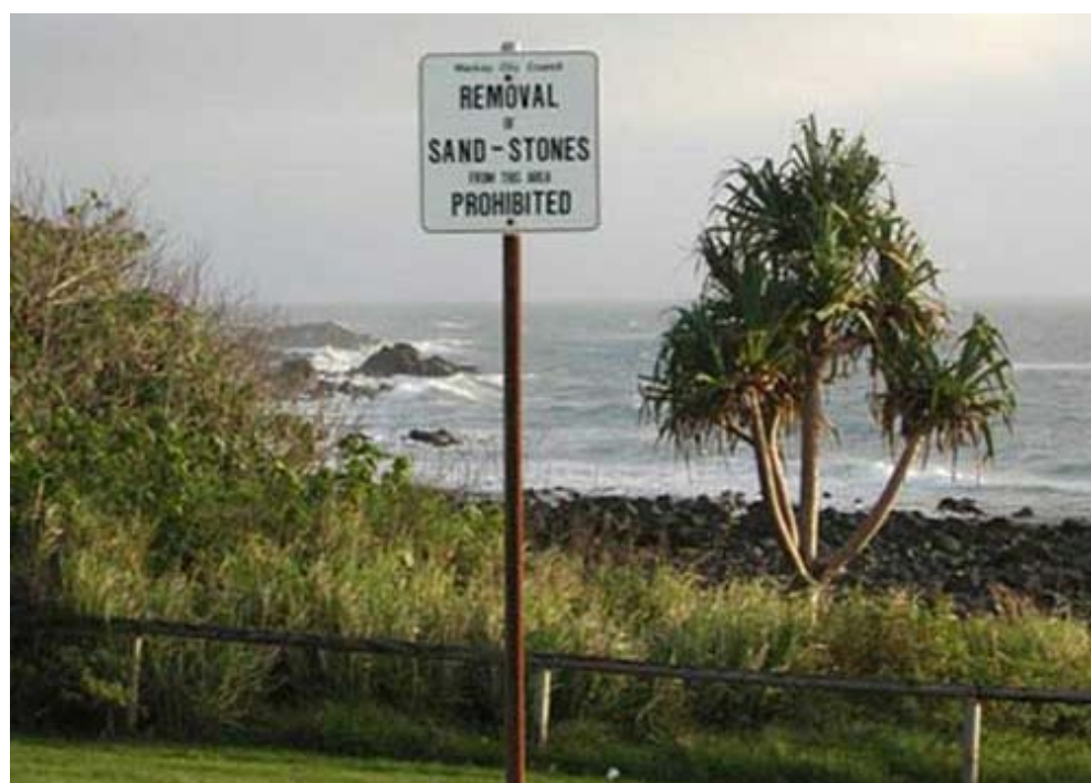
Sign adjacent to Turners Beach

Over time, as Karpathakis suggests is possible, the significance of my rock collecting practice changed and so too my intent in regard to the ritual and the artifacts themselves. There were no more corners in the garden that needed softening. In addition my conscience was provoked after considering a sign adjacent to Turners Beach which reads: Mackay City Council REMOVAL OF SAND – STONES FROM THIS AREA PROHIBITED . Figuring that I had progressed from a casual souvenir gatherer to a habitual removalist I decided on socio-ethico grounds that my practice should cease.