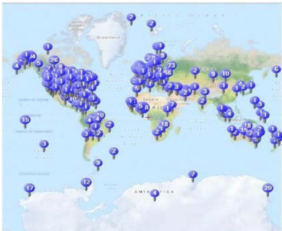
Figure 1 – One day of Gamergate (20 November 2014).

It wasn’t until mid-October that mainstream journalists picked up and attempted to report on Gamergate. Their interest was sparked when prominent gaming blogger and feminist Anita Sarkeesian cancelled a talk she was scheduled to give at the University of Utah after she was threatened by so called ‘Gamergaters’ because she was concerned for her safety. This was covered widely in gaming media (Starr 2014; Wingfield 2014). Mainstream media then engaged with the debate, and attempted to catch up. For example, an article on the Times website titled “What Is Gamergate and Why Are Women Being Threatened About Video